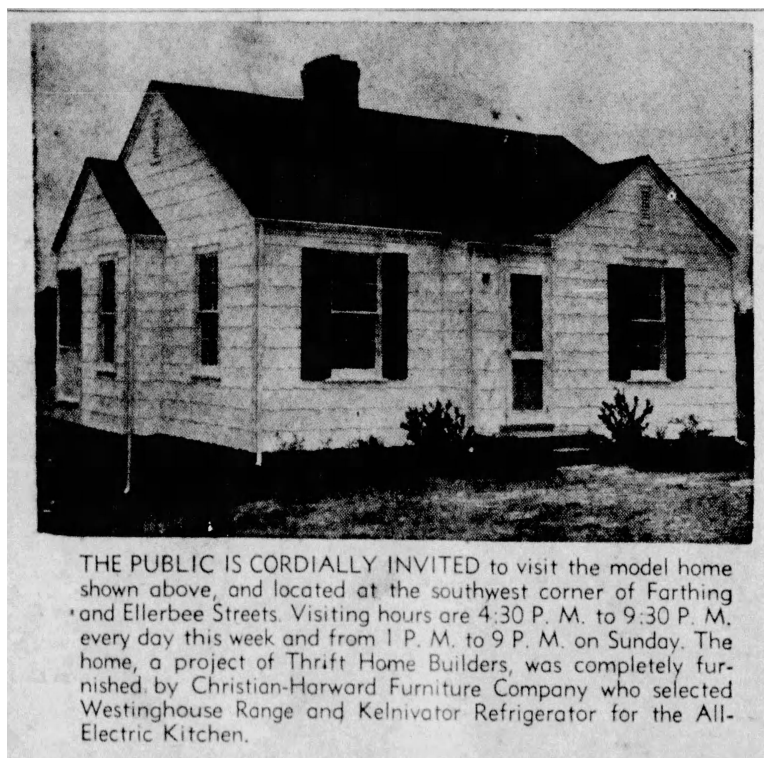
A home in the Edgewood subdivision of Northgate Park Historic District built by Thrift Home Builders, Herald-Sun , June 21, 1941

In the spring of 1942, Thrift Home Builders completed twenty-four “strictly modern” five-room homes in the Edgewood subdivision being developed near the newly established Northgate Park. Like the company’s other dwellings, the compact one-story, side-gabled Minimal Traditional houses epitomize the small house concept promoted by the Federal Housing Administration (FHA). Thrift Home Builders arranged financing, including garnering FHA insurance and funding from local banks. 22 Elsewhere in Northgate Park Historic District, Thrift Home Builders constructed at least eleven additional small houses on Farthing Street and Shenandoah and Highland Avenues. 23