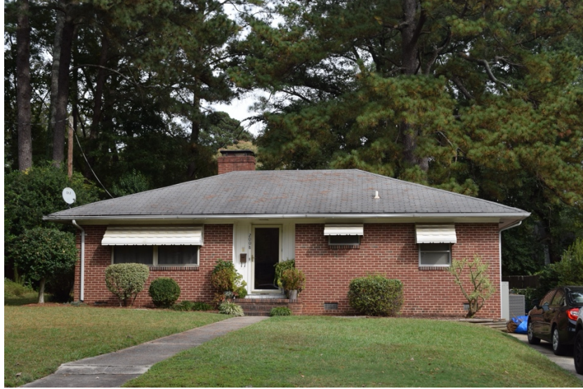
Minimal Ranch house at 2008 Woodview Drive, built 1954