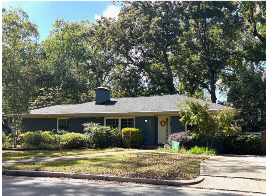
Ranch house at 2601 Farthing Street