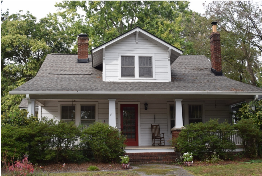
Craftsman bungalow at 111 Ellerbee Street

Period cottages, modest-sized English Tudor Revival dwellings mostly built in the 1940s, stand along North Roxboro Street and on nearby cross streets. Typically, side-gabled or with a clipped side gable roof, these predominantly brick dwellings include a prominent front facing gable and a façade or gable end chimney. Period cottages built after the Great Depression display more restrained elements than Tudor houses from the 1920s, which often included half-timbering and elaborate chimneys.