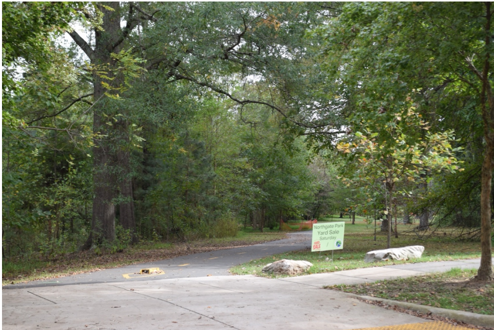
Greenway through Northgate Park, view to the south from West Lavender Avenue