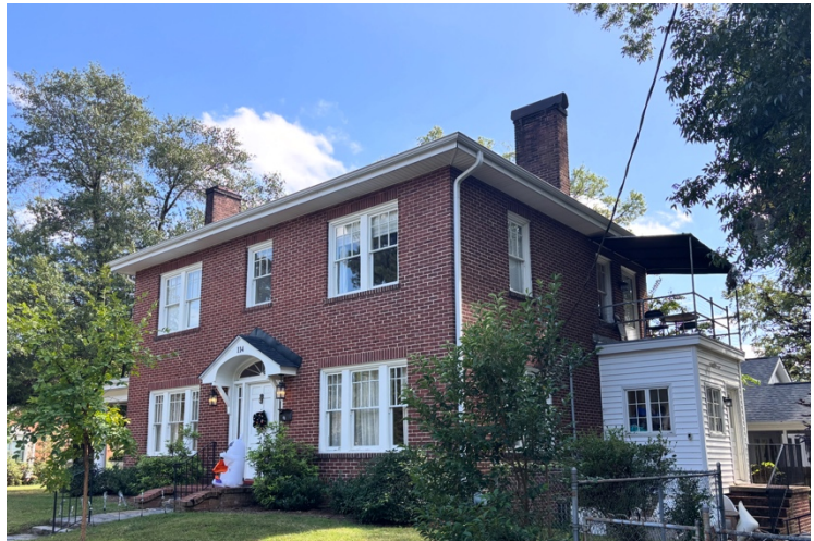
The 1920s Colonial Revival-style house at 2615 Highland Avenue is one of the earliest dwellings in the northeast part of the district

Construction in the 1920s and 1930s was sporadic in the area west of North Roxboro Street and included Craftsman bungalows and a two-story, Colonial Revival-style brick dwelling at 2615 Highland Avenue. John L. Sally Sr., a well-known contractor and builder in Durham from 1914 to 1942, constructed a group of several Craftsman style bungalows and foursquare houses in the early to mid-1920s on land he subdivided surrounding the junction of North Roxboro Street and East Ellerbee Street. 7