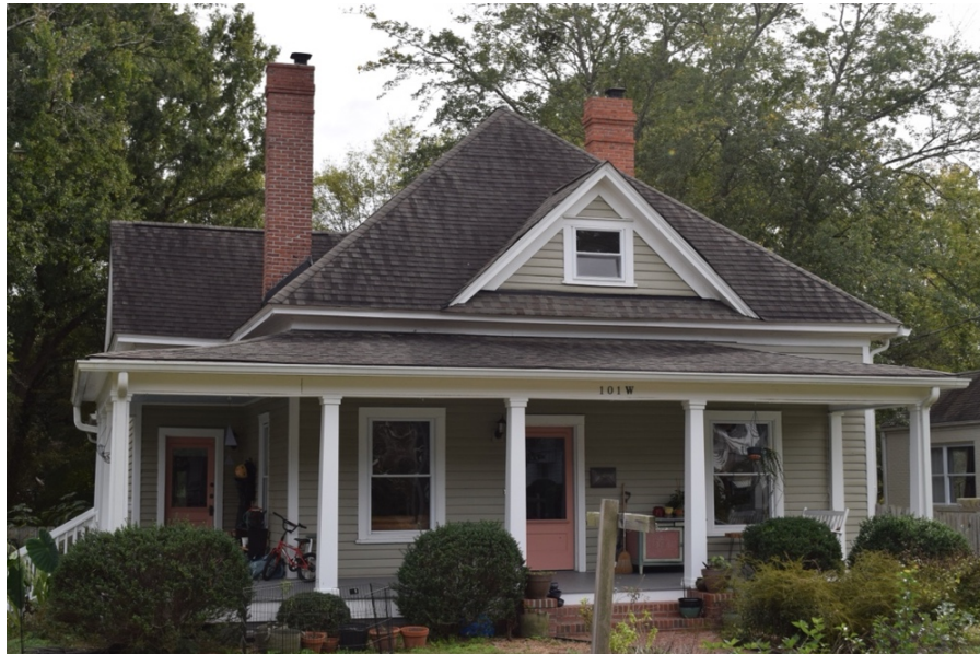
Queen Anne-style house built in 1912 at 101 West Delafield Avenue

weatherboard house with a pyramidal roof and wraparound porch displays intersecting front-gabled wings on its side elevations.