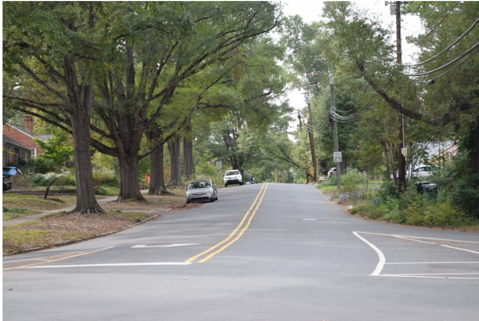
Glendale Avenue, view to the NW

Numerous subdivisions platted by various individuals and developers from 1924 to 1952 make up the majority of Northgate Park Historic District. Most of the district follows a grid plan except around Northgate Park, an expansive greenspace extending roughly north to south near the center of the west side of the district. Around the park, especially on the west side, some streets become more meandering to conform with the contours of the park's boundaries and to reflect principles of landscape design in the period after World War II.