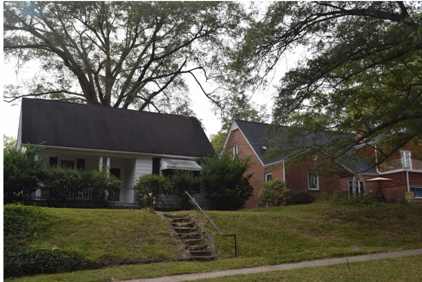
2301 and 2303 Glendale Avenue, view to the SW