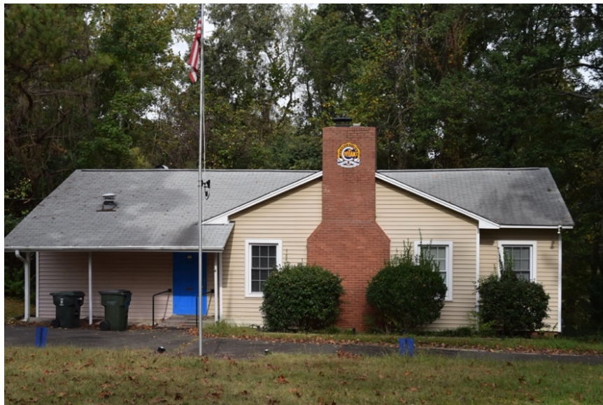
Girl Scout Hut, 1951, on Glendale Avenue

In September 1951, local Girls Scouts broke ground on "an attractive one-story building approximately 35 by 50 feet" on land on Glendale Avenue where they had been meeting