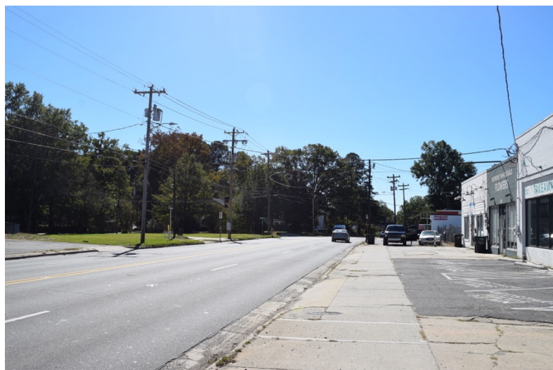
The unincorporated community of Bragtown developed along both sides of North Roxboro Street starting in the late nineteenth century. Remnants of the commercial center of Bragtown remain along North Roxboro Street, view to the south