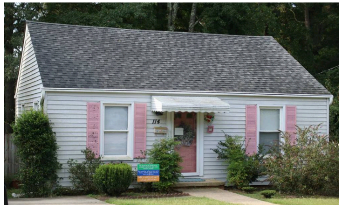
114 East Maynard Avenue built by Thrift Home Builders in 1940

In preparation for the Fort Butner project, Durham based Thrift Home Builders built or oversaw the construction of numerous Minimal Traditional homes, what the company called “thrift homes,” in the district and across Durham in the early 1940s. Thrift Home Builders produced house plans with uniform outlays, which were built by local subcontractors including Young Roofing, Paschall Brothers Plumbers, and Borden Brick and Tile Company. 20 In 1940, the company acquired land on the south side of East Maynard Avenue just west of Roxboro Street and built eleven uniform, one-story, side-gabled Minimal Traditional Houses. 21 All but the house that stood at 116 East Maynard Avenue remain.