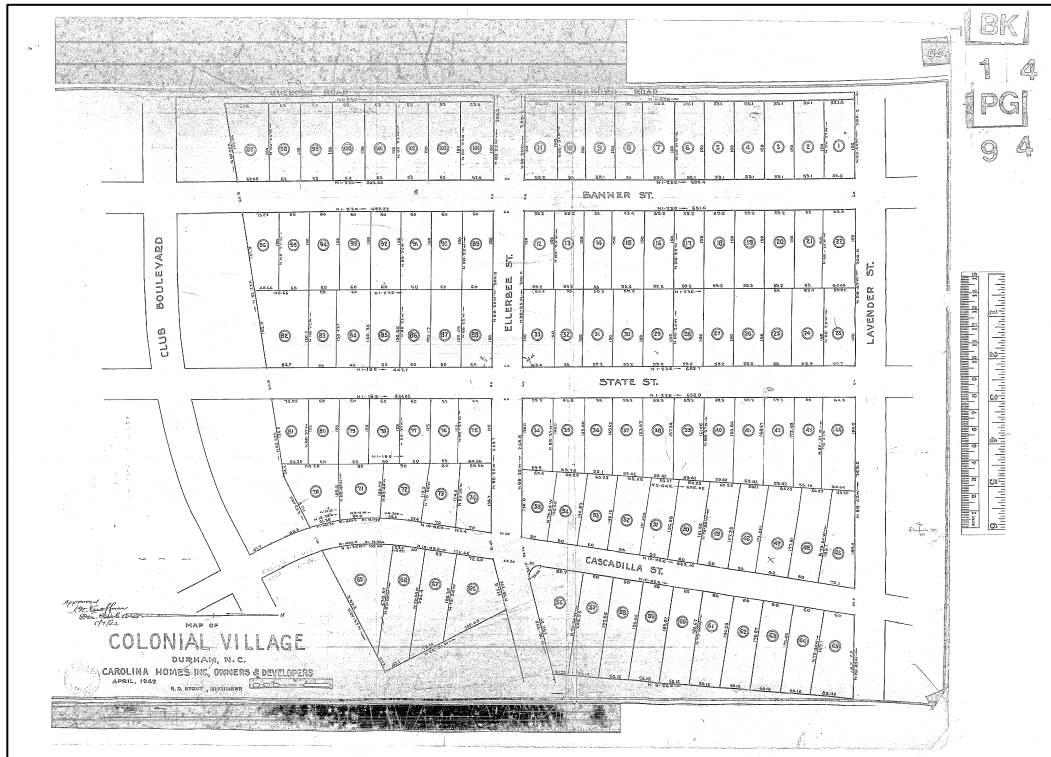
Plat for Colonial Village, April 1942, Plat Book 14, page 94

ads went on to describe Colonial Village houses as “five and six rooms with kitchen equipment furnished.” 25