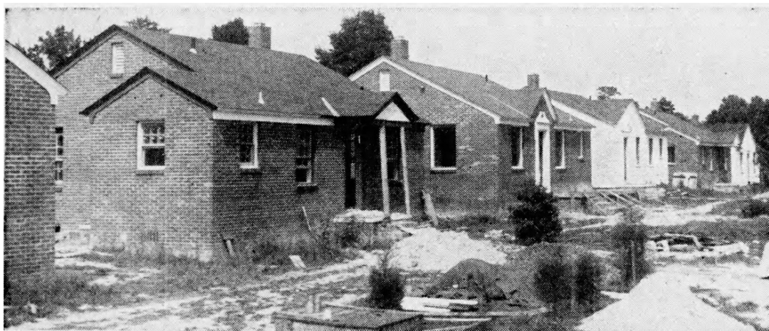
NEARLY COMPLETED HOUSES in Bragtown, in the section of Hammond and Banner Streets, are part of a project of 16 residential dwellings built by Draughon and Bishop Construction Company. A permit for $96,000 was issued for the construction April of this year.