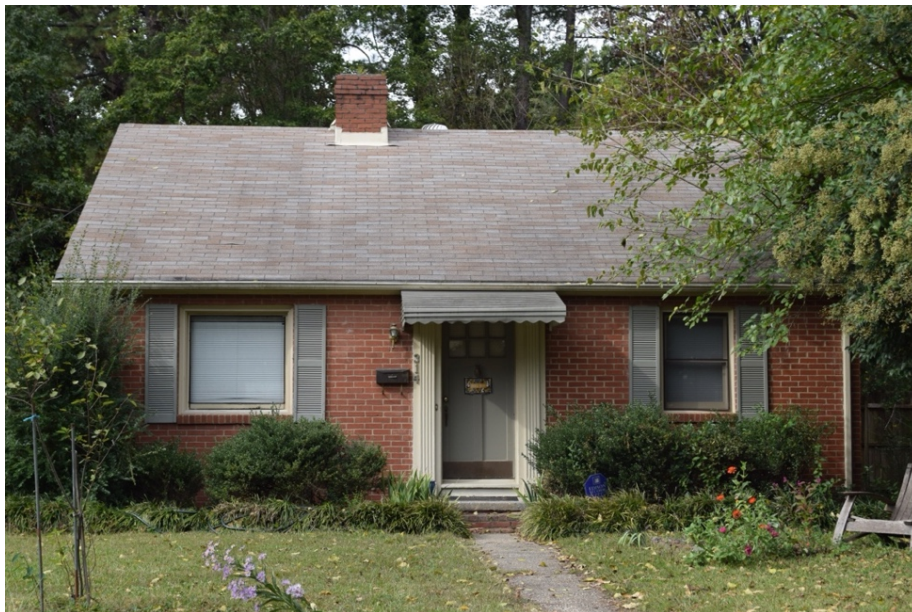
Brick Minimal Traditional, early 1940s, at 314 Greenwood Drive

By far, the most common house form in the district is the Minimal Traditional, sometimes called the FHA house because its compact size, simple form, and limited range of materials met the standards for construction set by the federal agency. Built primarily in the 1940s both during the second world war and after, Minimal Traditional houses in the Northgate Park Historic District have mostly low to intermediate side gable roofs and reserved to no architectural adornment. Front-facing, off-center wings sometimes break the monotony of the strict rectangular footprint. Tudor or Colonial Revival elements embellish a handful of the otherwise austere houses. Aluminum or vinyl siding, or brick veneer sheathe their exteriors.