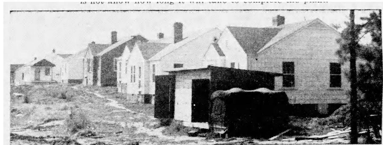
GLENDALE HEIGHTS DEVELOPMENT will eventually include approximately 50 residential homes. The construction is being done by the Piedmont Home and Construction Company.

Piedmont Home and Construction Company began construction of the first phase in April 1946. 34 This initial development contained fifty parcels on Glendale Avenue and Colgate, Ruby, and Ruffin streets. One month later in May 1946 on Colgate Street, the company began building the first prefabricated houses approved by Durham building inspectors. The local newspaper described the new houses as prefabricated of plywood but, “finished in the usual way, with plastered walls, and the outside of brick veneer, asbestos shingles, or wood siding.” The FHA approved these prefab houses with the stipulation that they be first offered to veterans. 35