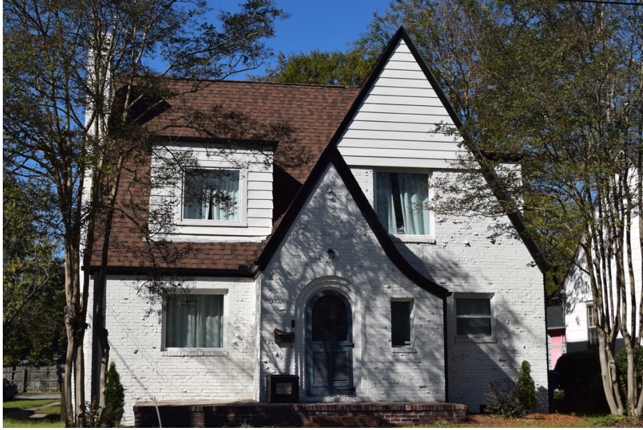
Two prominent front facing gables dominate the façade of the Period Cottage from 1945 at 2707 North Roxboro Street

By far, the most common house form in the district is the Minimal Traditional, sometimes called the FHA house because its compact size, simple form, and limited range of materials met the standards for construction set by the federal agency. Built primarily in the 1940s both during the second world war and after, Minimal Traditional houses in the Northgate Park Historic District have mostly low to intermediate side gable roofs and reserved to no architectural adornment. Front-facing, off-center wings sometimes break the monotony of the strict rectangular footprint. Tudor or Colonial Revival elements embellish a handful of the otherwise austere houses. Aluminum or vinyl siding, or brick veneer sheathe their exteriors.