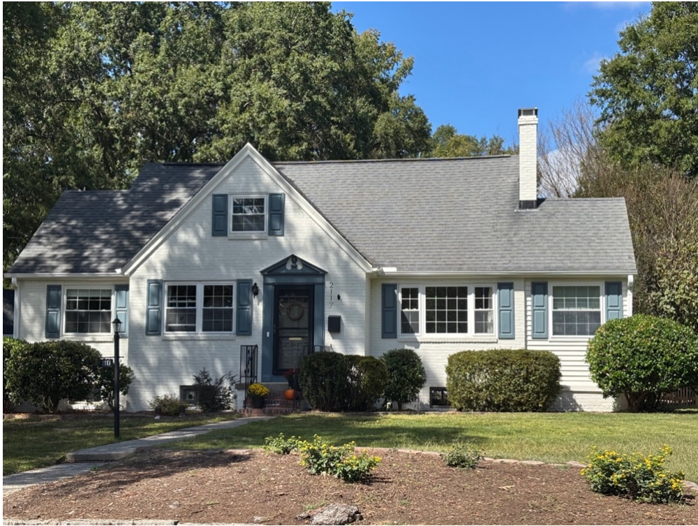
Minimal Traditional with Colonial Revival influence at 2117 Ruffin Street