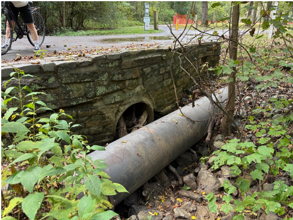
Stone culverts in the park carry the greenway over small streams