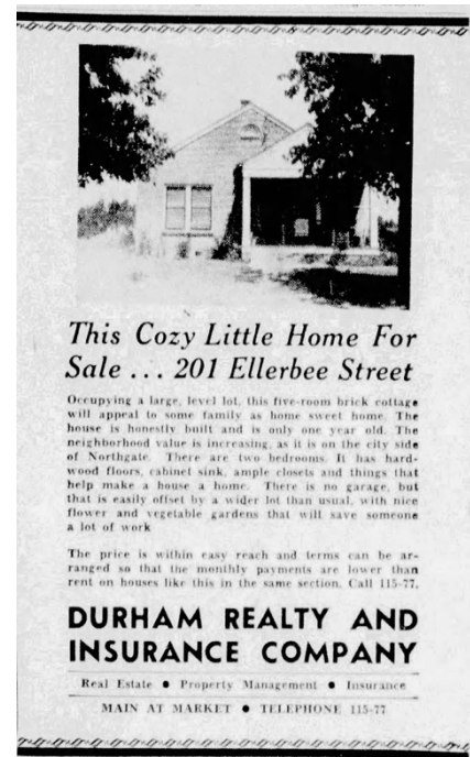
1938 advertisement for 201 Ellerbee Street