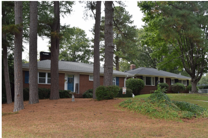
2107 and 2109 Woodview Drive, view to the W