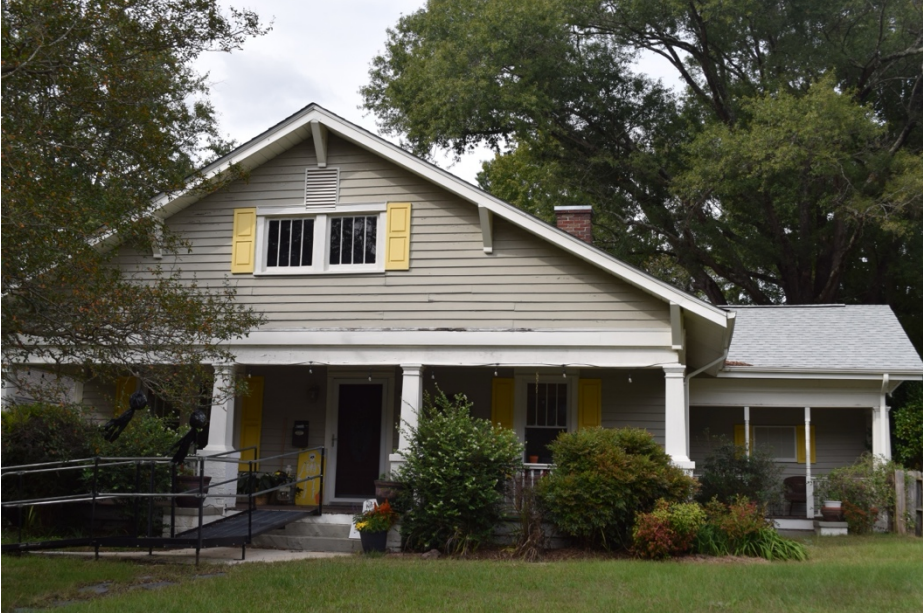
1920s bungalow at 106 West Delafield Avenue

Battered wood posts on brick plinths support a substantial front gable with knee braces along the eaves of the bungalow at 106 West Delafield Avenue. Built in the mid-1920s, the house retains four-over-one windows and a rear side-gabled wing. A group of five Craftsman-style houses of various forms stand near the junction of Farthing Street and Gresham Avenue. The one-story, side- and clipped-gable weatherboard and wood shingled houses date from the mid-1920s to early 1930s.