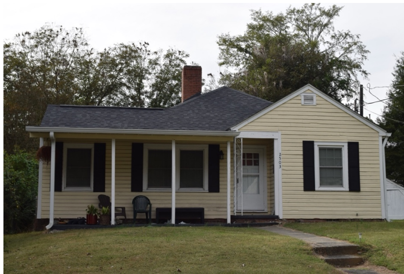
House at 2503 Banner Street was built in 1943 in Colonial Village

In the spring and summer of 1942, multiple newspaper advertisements for Player-Bethune Realty Company of Durham declared “we are building and have for sale to defense workers,