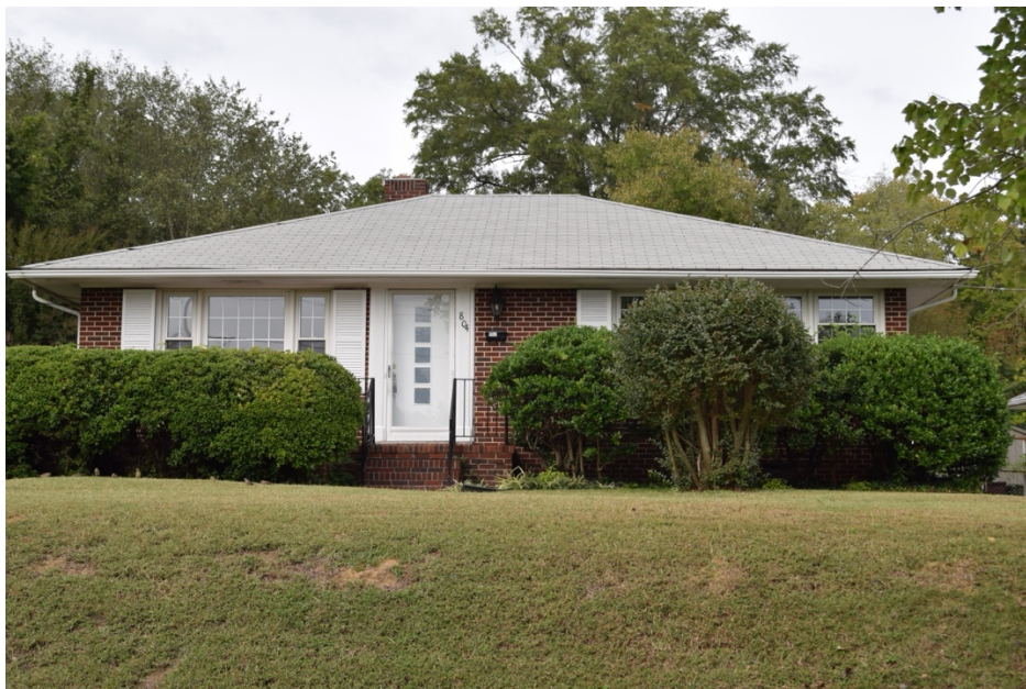
Ranch house at 804 Ruby Street