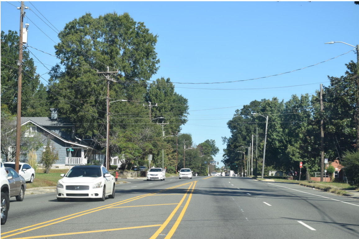
North Roxboro Street in Northgate Historic District, view to the north