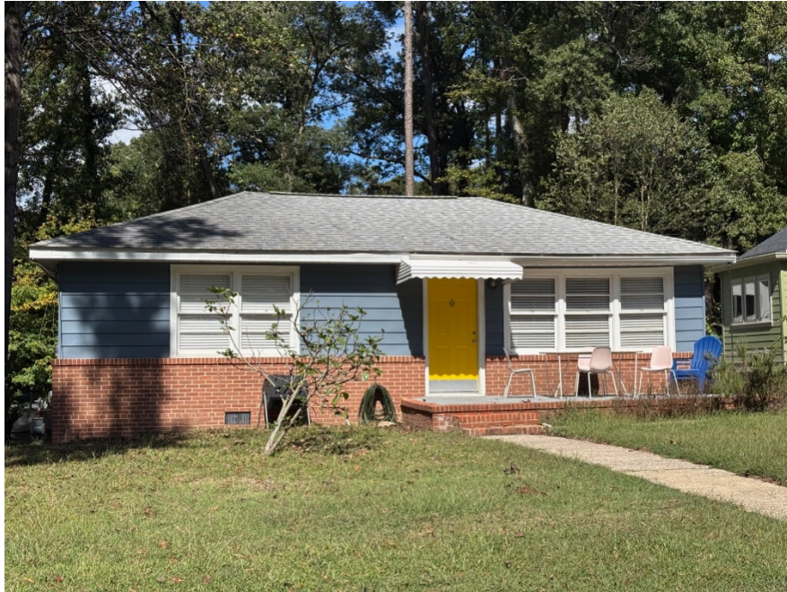
Ranch house at 1306 Gresham Avenue

Ranch houses appeared in substantial numbers in the district in the early 1950s, especially in the northwest section where the Glendale Heights subdivision developed from the late 1940s until around 1960. The earliest Ranch houses appear alongside Minimal Traditional dwellings. Sheathed in brick veneer, these Minimal Ranches, as they are sometimes called, have hipped or side-gable roofs and front doors sheltered by the roof overhang. Into the late 1950s, a few more elongated Ranch houses went up in the Glendale Heights.