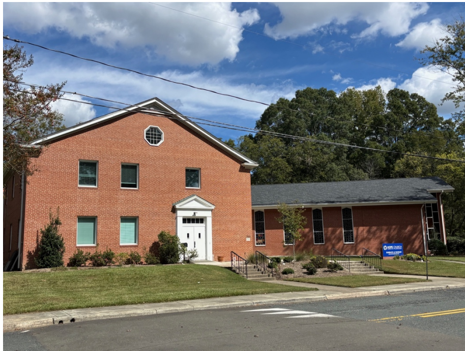
The 1955 fellowship building at Parkview Baptist Church dates to 1955. The sanctuary to the right was added in 1970

Two brick churches occupy the district. The original 1955 portion of Parkview Baptist Church at 2500 Acadia Street is a two-story, gable-front building with a Colonial Revival style pedimented portico framing its entrance. The 1970 brick sanctuary designed by architects Haskins and Rice of Raleigh complements the original building in its front gable form but reflects the influence of modernism. Northgate Presbyterian Church built a Colonial Revival style brick church at 2504 North Roxboro Street in 1949. A monumental front-gabled portico spans the façade. The congregation built a two-story, brick Colonial Revival education wing in 1963.