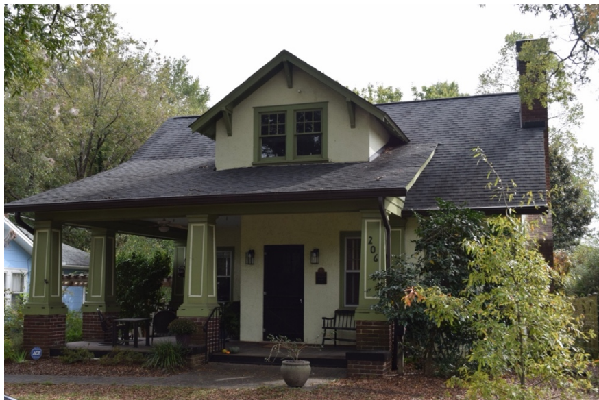
Marshall-Dickson House at 206 East Hammond Street, built 1928

A few bungalows and Craftsman-style houses appear in the northern part of the district where building occurred prior to the suburban development that characterized the area beginning around 1940. The highly intact, one-and-a-half-story, side-gabled, stucco over masonry bungalow at 206 East Hammond Street dates to 1928. Known as the Marshall-Dickson House, it features a wraparound and partially inset front porch and a bracketed front dormer. 1