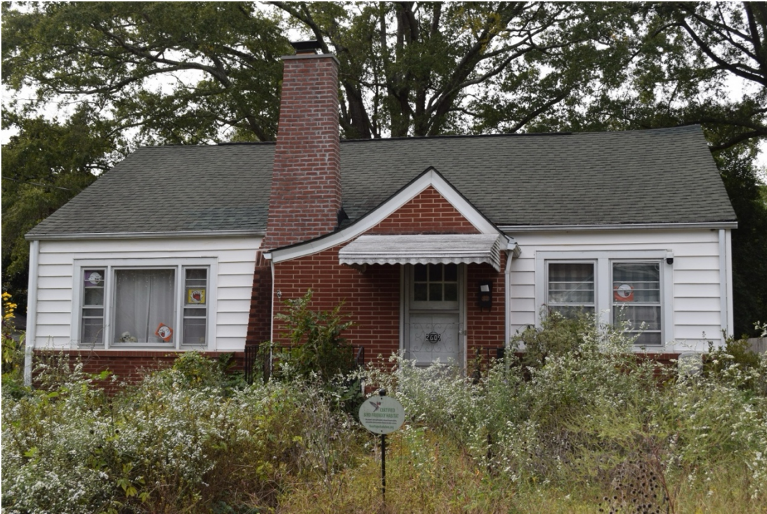
Minimal Traditional with Tudor Revival front gable and façade chimney at 2609 Highland Avenue