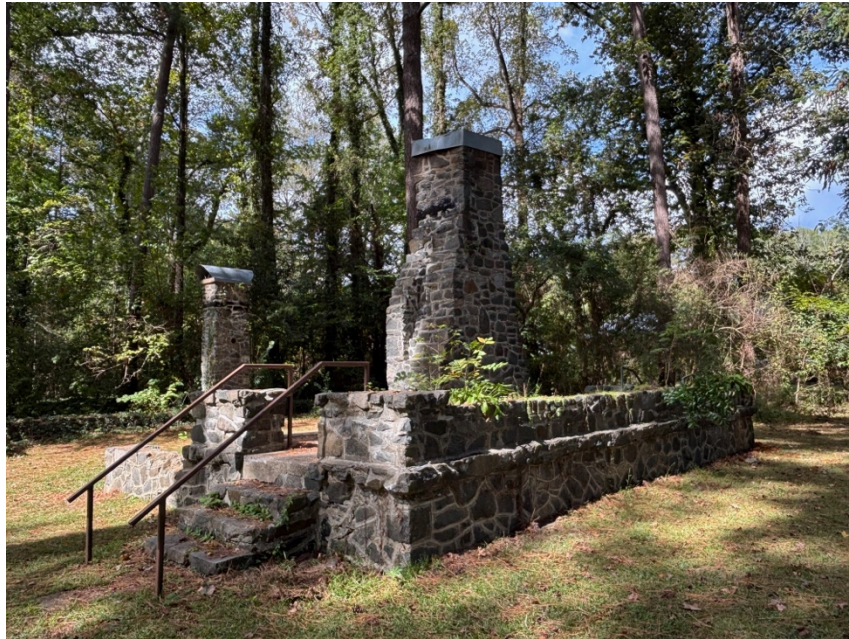
Remains of the Children’s Museum built in the park in 1946

the museum obtained a long-term lease from the city for land on Murray Avenue north of Northgate Park and built a more substantial facility. After a period of expansion, in the early 1970s it became the North Carolina Museum of Life and Science. 39 It is located on Murray Avenue immediately north of the Northgate Park Historic District. The original 1946 children’s museum that stood in Northgate Park was disassembled in 2014 after years of flooding from Ellerbee Creek. 40 Two stone chimneys and the stone foundation remain.