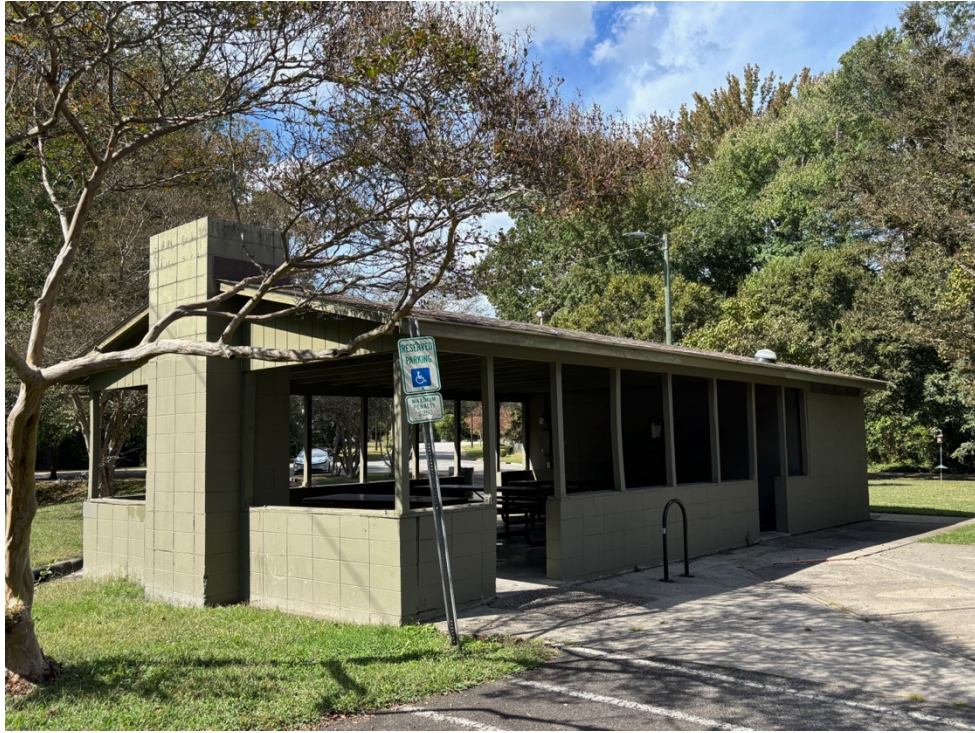
Circa 1960 concrete block picnic shelter in Northgate Park