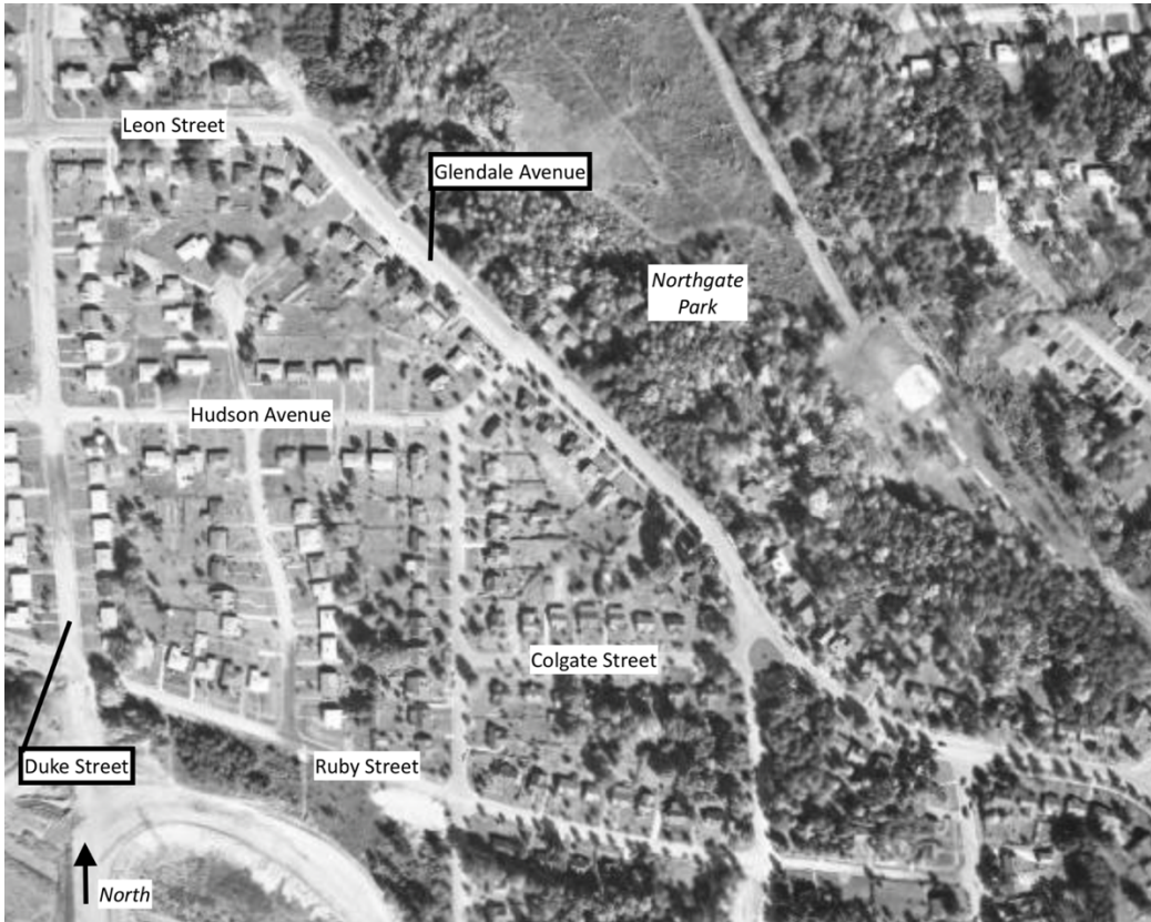
Glendale Heights subdivision was the last area in the district to be developed. By the time this aerial photograph was taken in 1950s, Glendale Heights subdivision had been built out. NCDOT Historical Aerial Imagery Index