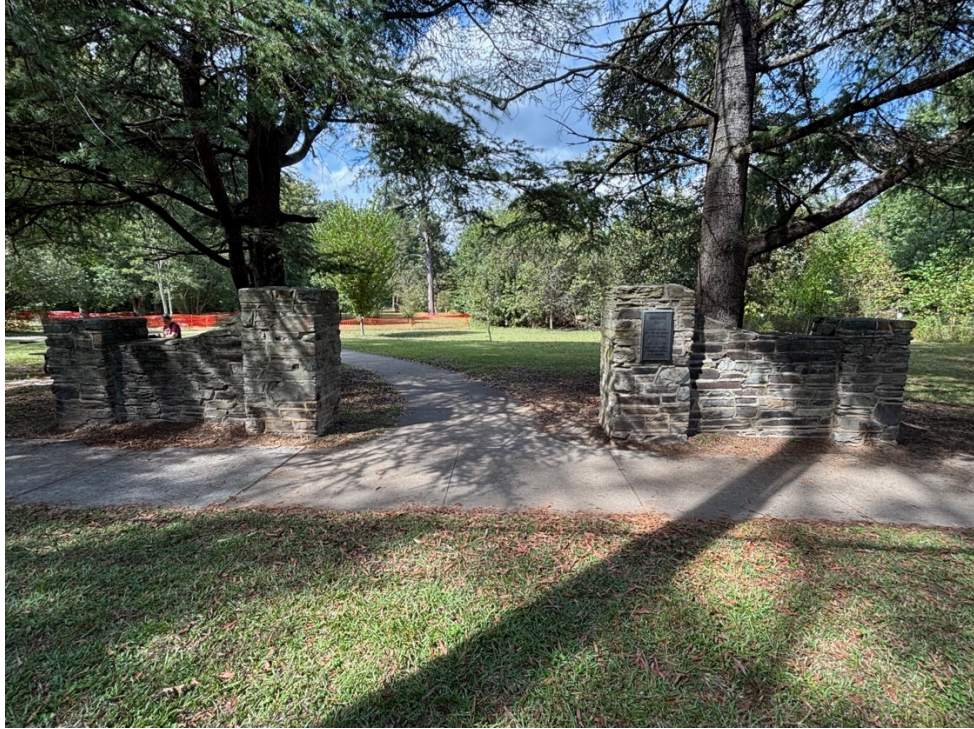
1940 entrance gate to Northgate Park on the north side of Club Boulevard