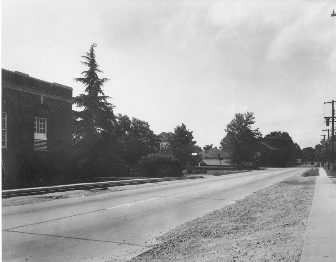
Two-lane Roxboro Street to the north from Murray Avenue, ca. 1953