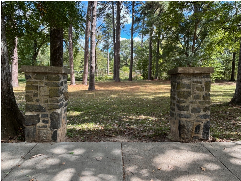
Stone pillars on the south side of Lavender Avenue provide entrance to the park