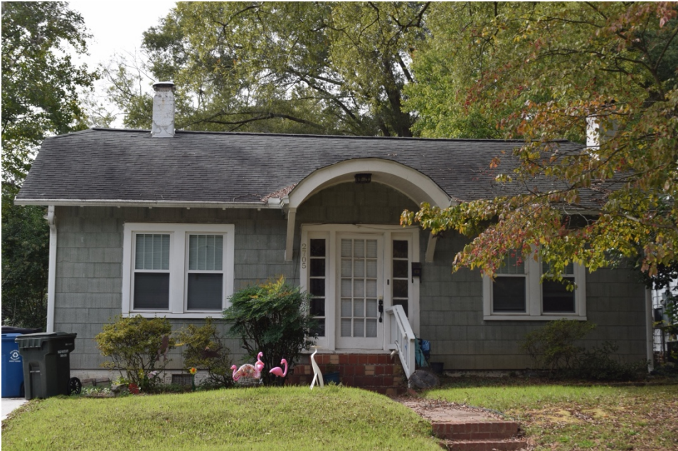
Craftsman style house at 2705 Farthing Street