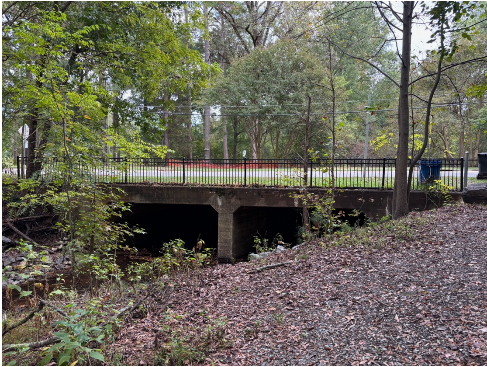
Concrete bridge carries West Lavender Avenue over Ellerbee Creek in Northgate Park