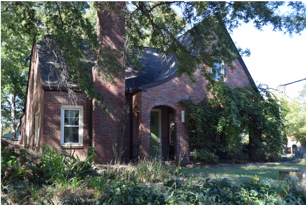
Circa 1940 Martha and Harrell Mangum House is a brick Period cottage at 2725 North Roxboro Street that includes a swooping roof over the entrance bay

Period cottages, modest-sized English Tudor Revival dwellings mostly built in the 1940s, stand along North Roxboro Street and on nearby cross streets. Typically, side-gabled or with a clipped side gable roof, these predominantly brick dwellings include a prominent front facing gable and a façade or gable end chimney. Period cottages built after the Great Depression display more restrained elements than Tudor houses from the 1920s, which often included half-timbering and elaborate chimneys.