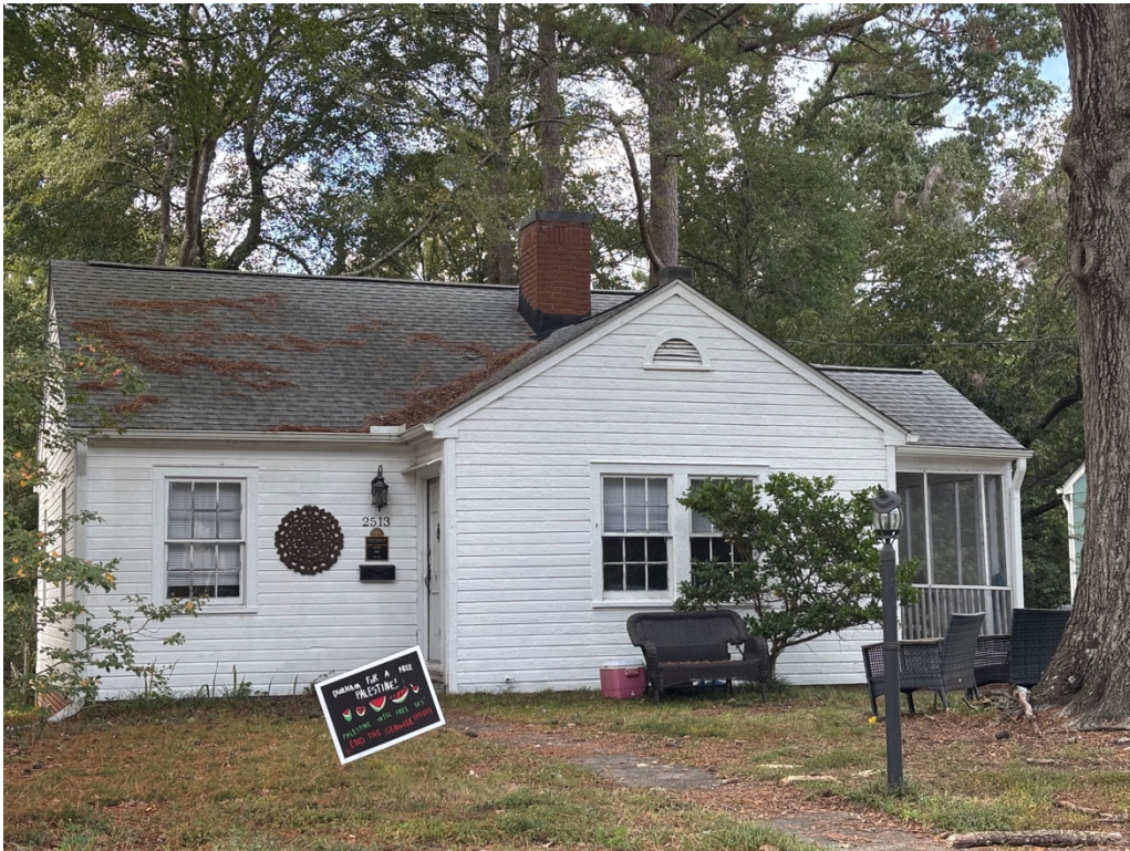
Minimal Traditional with original wood siding, 2513 Banner Street