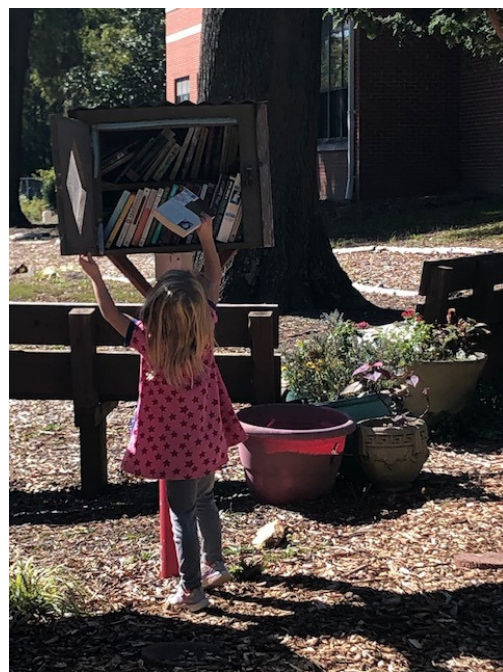
A child looking at books in the little library in front of Club Blvd. school