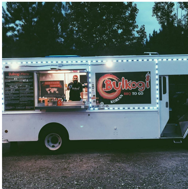
Picture of Bulkogi Food Truck

Interneighborhood Council has continued its advocacy for residents on key concerns including development, transit, UDO revisions, safety, community-building & more. Topics in the Dec-Feb quarter included the upcoming DCCO Comp Development Plan update, the NIS Equitable Engagement blueprint, and a presentation from Durham Mutual Aid groups.