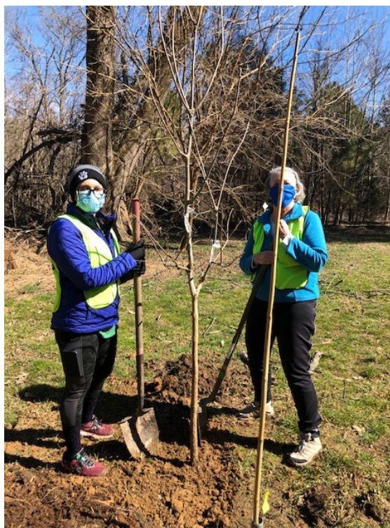
Tree-planting day in Northgate Park