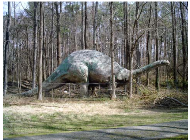
Our beloved dino (before the beheading)

For those not familiar with our prehistoric pal, the Brontosaurus is located along the path headed toward the museum and was part of their original dino-