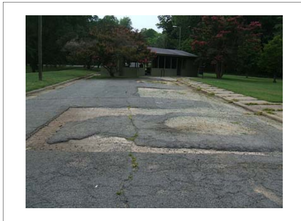
The Tennis Court Parking Lot (not slated for repair or renovation)