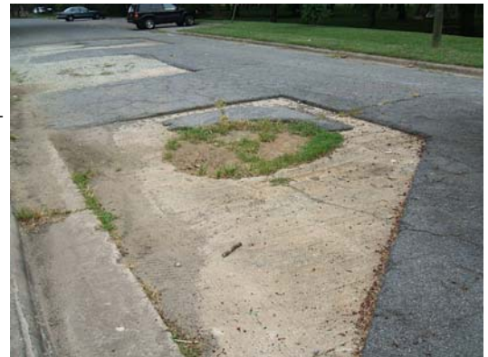
Make our Park Complete!

So what's left? If we receive funding for phase two , there would be money to refurbish the tennis court picnic shelter, re-pave the parking lot around it, finish the sidewalk on the Glendale corner, improve drain-