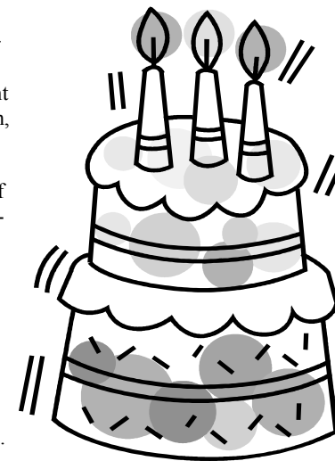
Happy 70th Birthday Northgate Park!

If you've ever wondered why some of those joists in your attic are thick and unplanned, who some famous past residents are or if you'd like to meet fellow neighbors who've lived in the neighborhood longer than most