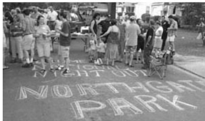
Neighbors and law enforcement gather for National Night Out 2008

Last year's National Night Out campaign involved citizens, law enforcement agencies, civic groups, businesses, neighborhood organizations and local officials from over 15,000 communities from all 50 states, U.S. territories, Canadian cities and military bases worldwide. In all, over 36 million people participated in National Night Out 2009.